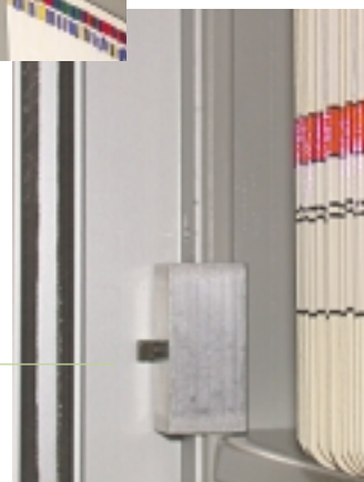
A 1¼" channel on the side frame allows for file clearance.

Housing and Door Design. Quik-Roll's housing is pre-assembled and contains a counterbalanced spring for easy lifting. This design also acts as a brake to prevent rapid closing speeds. Lightweight metal slats combine a polyurethane foam core with an aluminum cover to create a modern and finished look when the door is closed.